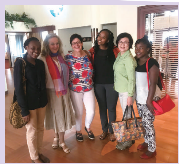
Near East & Africa Regional Meeting in Nairobi, Kenya

In January and July, we visited Shenzhen and had exchanges with the Shenzhen Medical Women Association, the Beijing University Shenzhen Hospital, biotechnology industry and medical equipment corporations in Shenzhen. There will be more opportunities for synergy and cooperation between Shenzhen and Hong Kong because of our geographical proximity and our shared goal of advancement in science and technology.