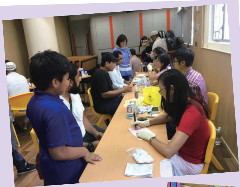
Finger prick test for blood glucose and cholesterol

It's been a nice experience interacting with the ethnic minorities and families living in subdivided flats. Most of them do not usually go to clinics when health problems arise, so this was a chance for them to meet doctors to discuss their health concerns. More importantly, it was about health education – only during the counselling session could we pick up their needs for adjustment of their diet and lifestyle. For the ethnic minorities group, they have special ways of cooking as well as their own spices, making them prone to poor chronic health conditions. This could be addressed during such health counselling sessions. The outreach activity makes me recognize the many different lifestyles of different ethnicities as well as social classes, allowing me to understand different backgrounds of my patients better in the future.