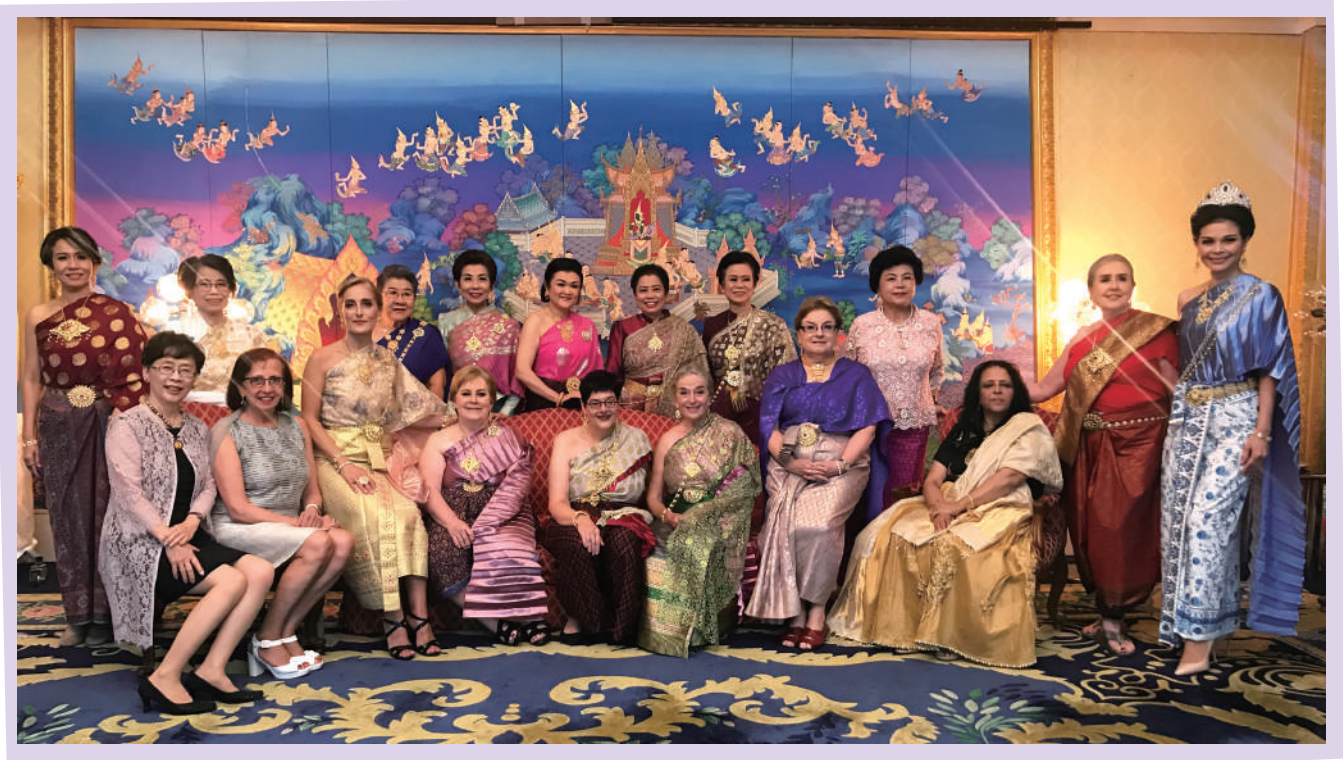
Central Asia Regional Meeting of MWIA in Bangkok