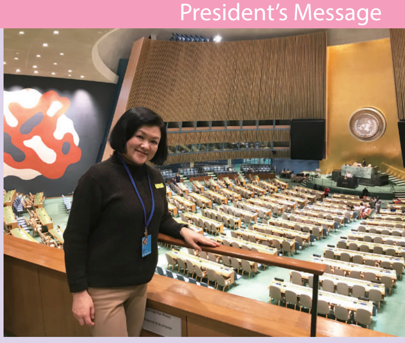
United Nation's Commission on the Status of Women in New York

HKWDA has been promoted to our fellow medical professionals around the globe in 2018. In my capacity as the Vice President of the Medical Women's International Association (MWIA), I have taken five overseas trips to visit women leaders and medical women within the Western Pacific Region and other parts of the world. In March, I joined the United Nations' Commission on the Status of Women in New York City. In April, I attended the South European Regional Meeting in Palermo, Italy. In July, I visited the Philippines Medical Women's Association in Cebu. In September, I attended the Central Asia Regional Meeting in Bangkok and participated in the MWIA Executive Committee meeting. In November, I attended the Near East and Africa Regional Meeting in Nairobi, Kenya. I note that